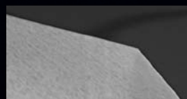
REM view of a diamond knife blade